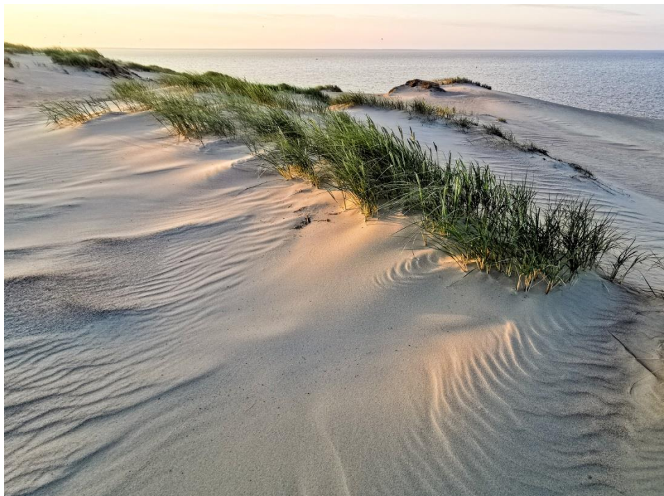
Sunrise over the dunes of the Curonian Spit