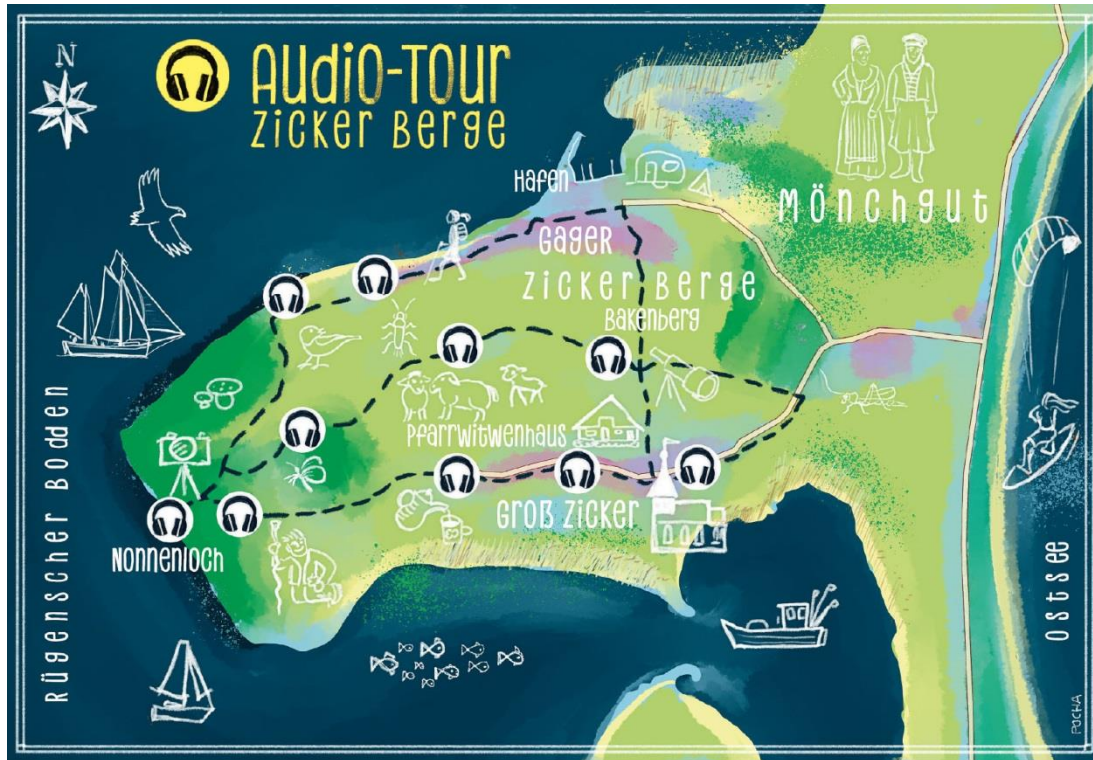
BRASOR: Promotional Postcard, Hiking trail and Audio-Stations in the Zicker Bergedeop at the Biosphere Reserve South east Rügen within the Interreg Central Europe Project CEETO.

CEETO Project final Conference: https://www.dunc-heritage.eu/ceeto-project-inspirational-final-conference-and-projects-results/